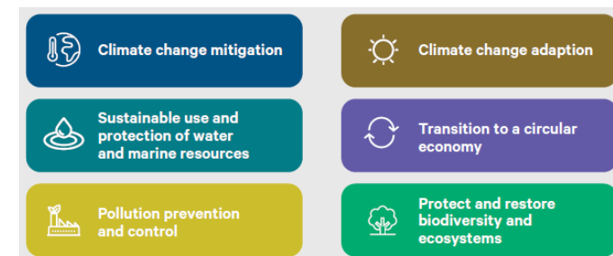
Fig. 3: EU Taxonomy environmental objectives