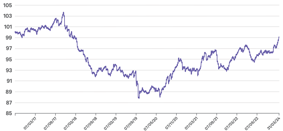
Figure 1: Performance of Target Return Foundation Fund at 31 st March 2024