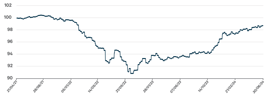
Figure 1: Performance of the Low Duration Credit Fund at 30 th June 2024

Data shown is correct as at 30 th May 2024.