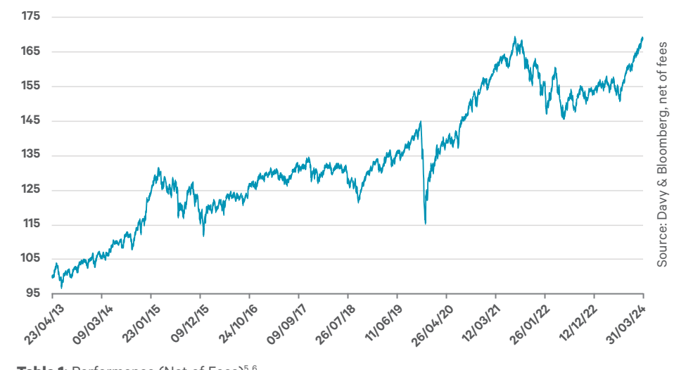
Table 1: Performance (Net of Fees)

Figure 1: Performance of Davy Moderate Growth Fund at 31st March 2024<sup>6</sup>