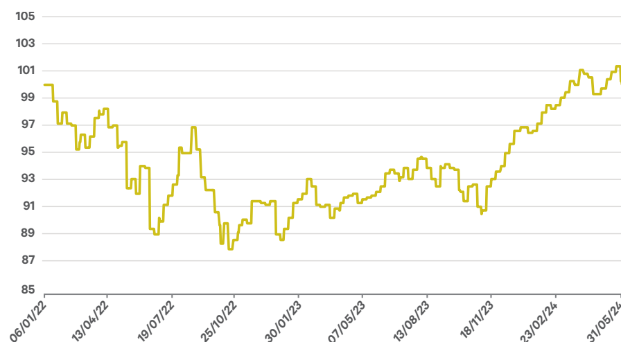
Figure 1: Performance of Davy SRI Moderate Growth Fund at 31 st May 2024