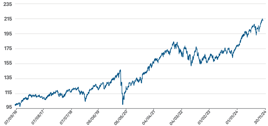
Figure 1: Performance of Global Equities Foundation Fund at 30 th November 2024