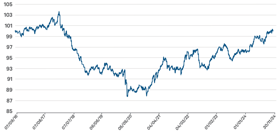
Figure 1: Performance of Target Return Foundation Fund at 30 th November 2024