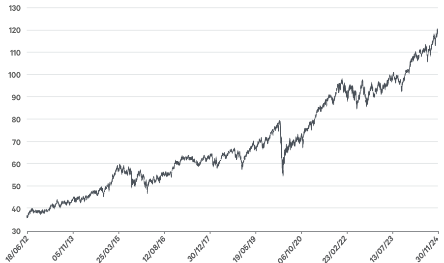
Table 1: Performance (Net of Fees) 5*