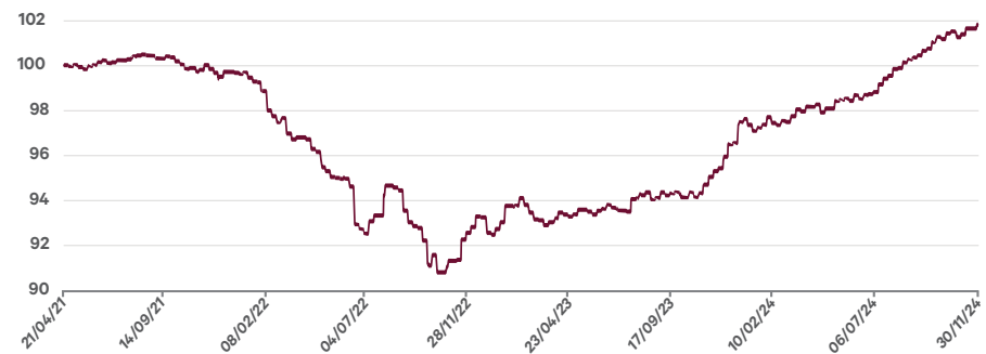
Figure 1: Performance of the Low Duration Credit Fund at 30 th November 2024

Data shown is correct as at 31 st October 2024.