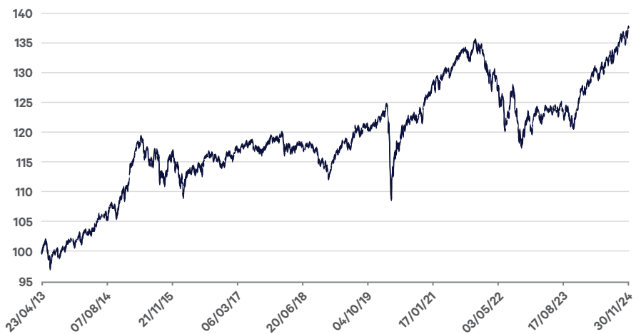
Figure 1: Performance of Davy Cautious Growth Fund at 30 th November 2024 5

Warning: Past Performance is not a reliable guide to future performance. The value of your investment may go down as well as up. This product may be affected by changes in currency exchange rates.