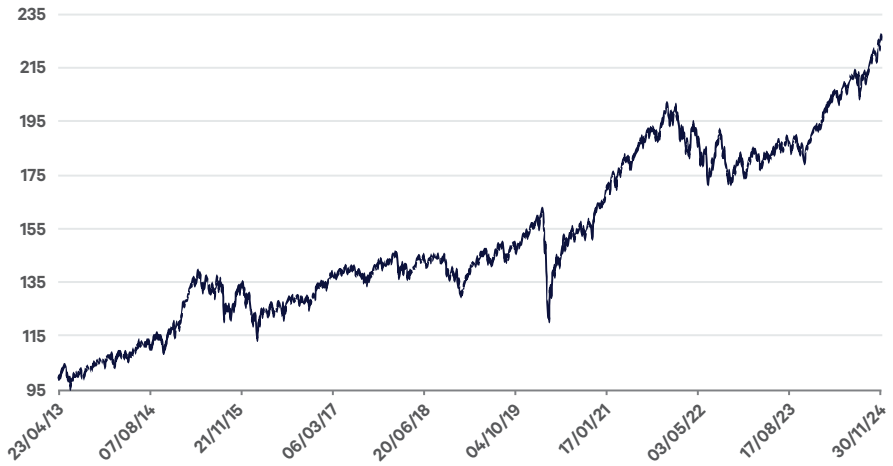
Figure 1: Performance of Davy Long Term Growth Fund at 30 th November 2024 6

Warning: Past Performance is not a reliable guide to future performance. The value of your investment may go down as well as up. This product may be affected by changes in currency exchange rates.