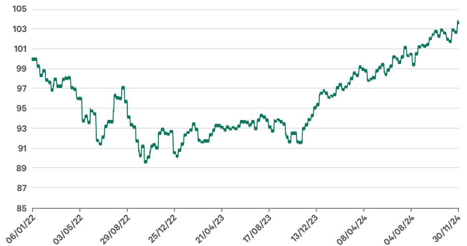
Figure 1: Performance of Davy SRI Cautious Growth Fund at 30 th November 2024