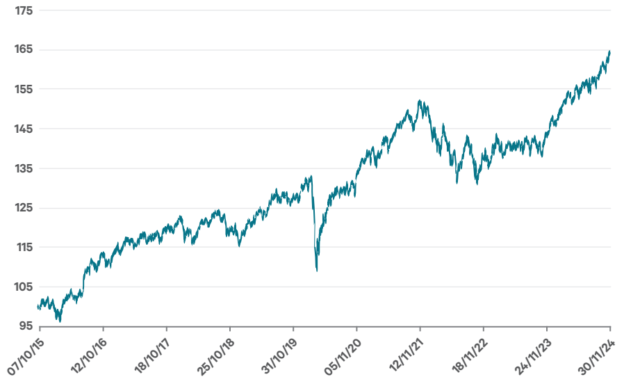
Figure 1: Performance of Davy UK GPS Moderate Growth Fund at 30 th November 2024

Warning: Past Performance is not a reliable guide to future performance. The value of your investment may go down as well as up. This product may be affected by changes in currency exchange rates.