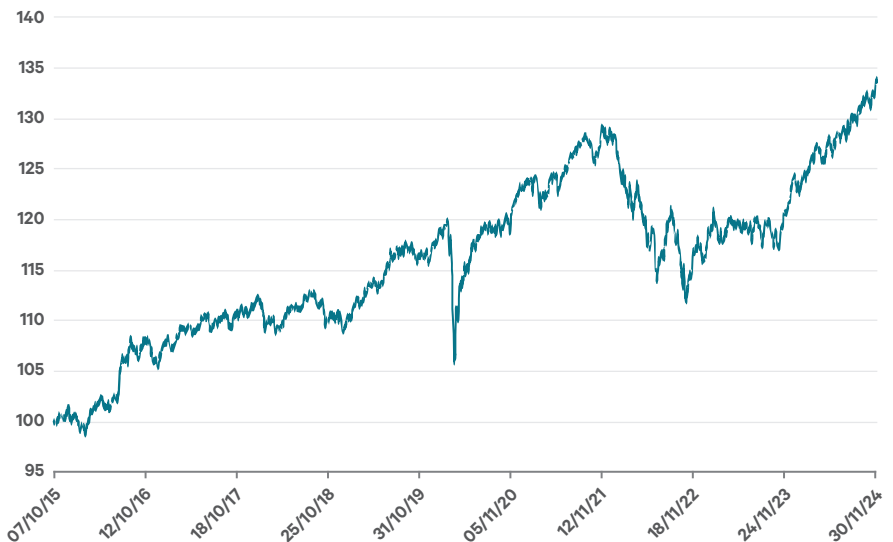
Figure 1: Performance of Davy UK GPS Cautious Growth Fund at 30 th November 2024

Warning: Past Performance is not a reliable guide to future performance. The value of your investment may go down as well as up. This product may be affected by changes in currency exchange rates.