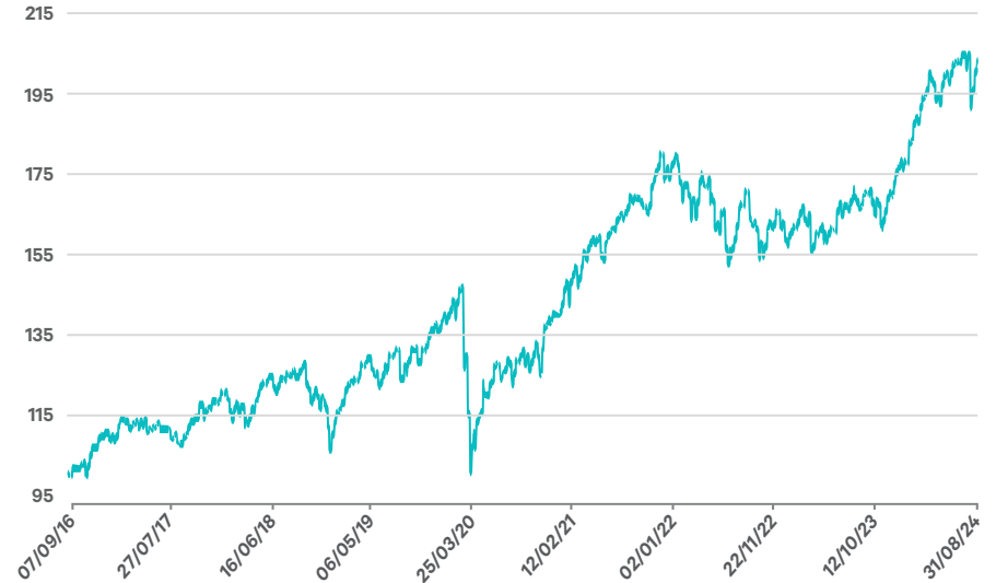
Figure 1: Performance of the Factor Equity Foundation Fund at 31 st August 2024

Warning: Past Performance is not a reliable guide to future performance. The value of your investment may go down as well as up. This product may be affected by changes in currency exchange rates.