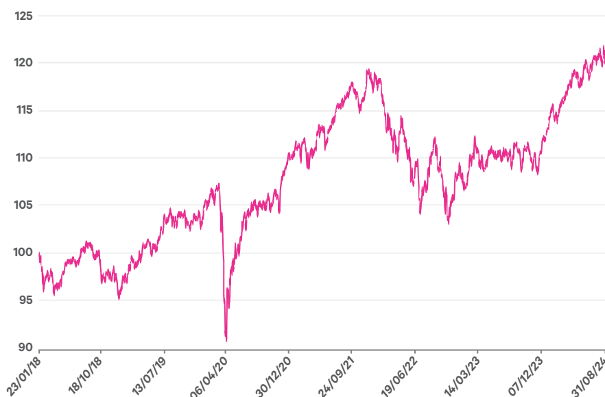
Figure 1: Performance of the Davy UK GPS Defensive Growth Fund at 31 st August 2024

Warning: Past Performance is not a reliable guide to future performance. The value of your investment may go down as well as up. This product may be affected by changes in currency exchange rates.