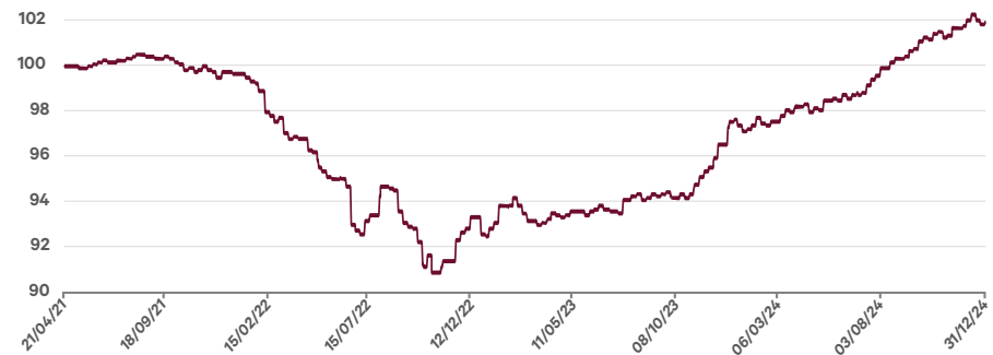
Figure 1: Performance of the Low Duration Credit Fund at 30 th November 2024

Data shown is correct as at 30 th November 2024.