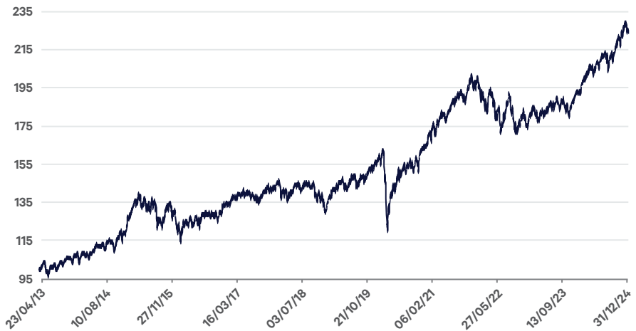
Figure 1: Performance of Davy Long Term Growth Fund at 31 st December 2024 6

Warning: Past Performance is not a reliable guide to future performance. The value of your investment may go down as well as up. This product may be affected by changes in currency exchange rates.