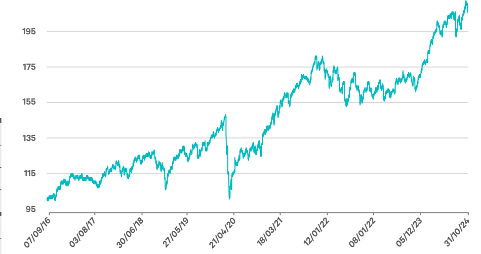
Figure 1: Performance of the Factor Equity Foundation Fund at 31st October 2024

Warning: Past Performance is not a reliable guide to future performance. The value of your investment may go down as well as up. This product may be affected by changes in currency exchange rates.