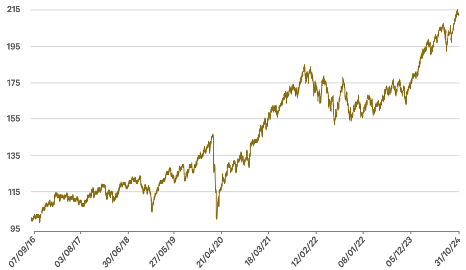
Figure 1: Performance of the Global Equities Foundation Fund at 31 st October 2024

Warning: Past Performance is not a reliable guide to future performance. The value of your investment may go down as well as up. This product may be affected by changes in currency exchange rates.