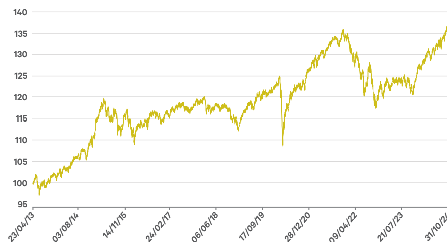
Figure 1: Performance of Davy Cautious Growth Fund at 31 st October 2024 6

Warning: Past Performance is not a reliable guide to future performance. The value of your investment may go down as well as up. This product may be affected by changes in currency exchange rates.