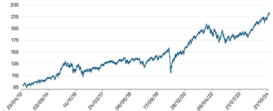
Figure 1: Performance of Davy Long Term Growth Fund at 31 st October 2024 6

Warning: Past Performance is not a reliable guide to future performance. The value of your investment may go down as well as up. This product may be affected by changes in currency exchange rates.