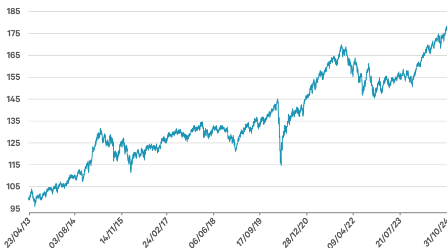
Figure 1: Performance of Davy Moderate Growth Fund at 31 st October 2024 6

Warning: Past Performance is not a reliable guide to future performance. The value of your investment may go down as well as up. This product may be affected by changes in currency exchange rates.