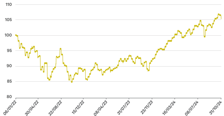
Figure 1: Performance of Davy SRI Long Term Growth Fund at 31 st October 2024

Warning: Past Performance is not a reliable guide to future performance. The value of your investment may go down as well as up. This product may be affected by changes in currency exchange rates.