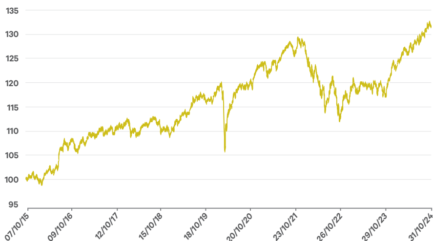
Figure 1: Performance of Davy UK GPS Cautious Growth Fund at 31 st October 2024

Warning: Past Performance is not a reliable guide to future performance. The value of your investment may go down as well as up. This product may be affected by changes in currency exchange rates.