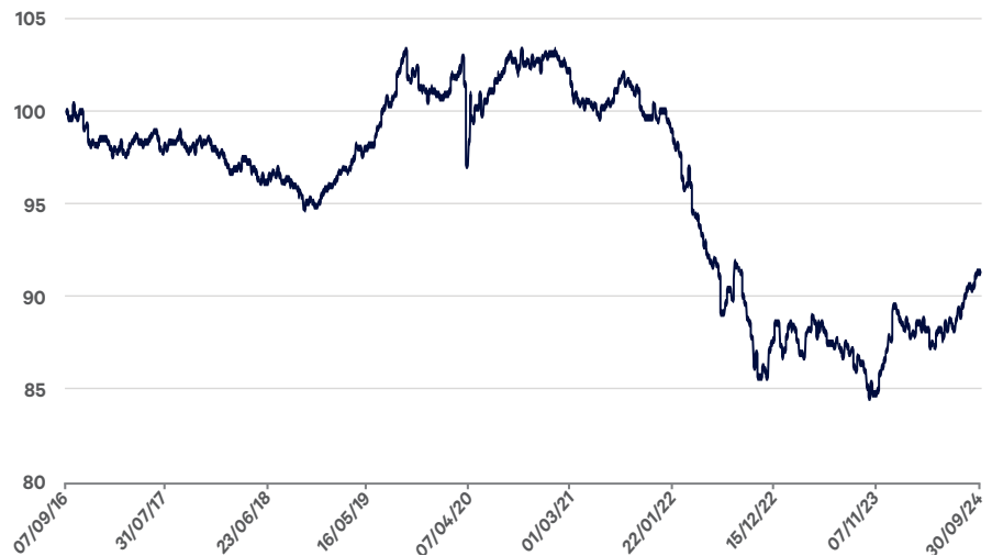
Figure 1: Performance of Global Fixed Income Foundation Fund at 30 th September 2024

Warning: Past Performance is not a reliable guide to future performance. The value of your investment may go down as well as up. This product may be affected by changes in currency exchange rates.