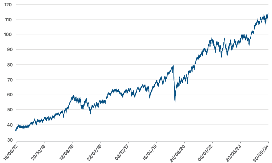
Table 1: Performance (Net of Fees) 5*