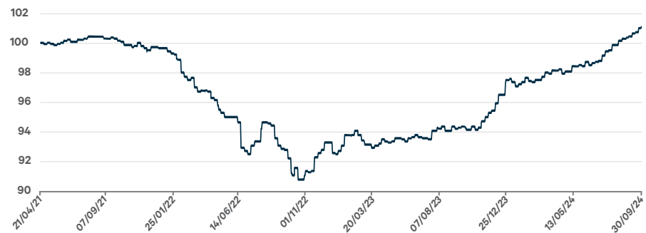
Figure 1: Performance of the Low Duration Credit Fund at 30 th September 2024

Data shown is correct as at 31 st August 2024.