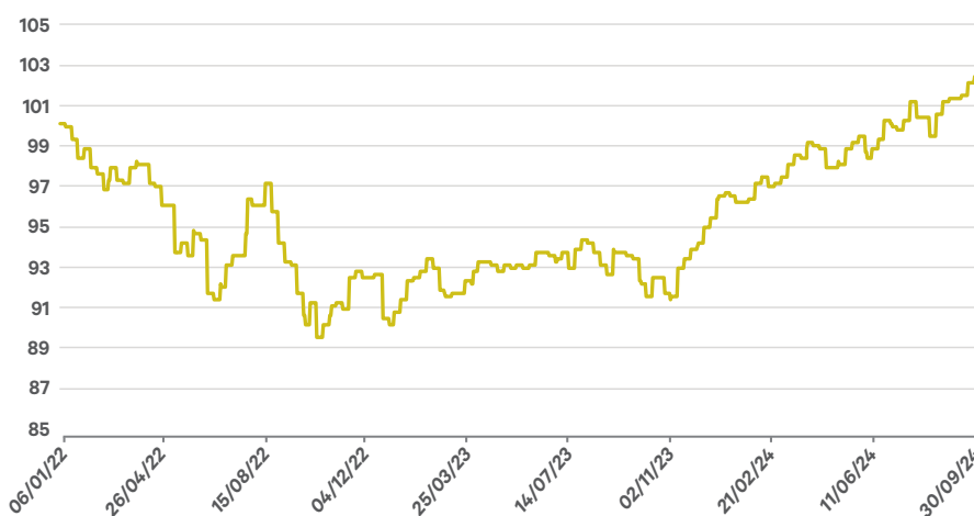
Figure 1: Performance of Davy SRI Cautious Growth Fund at 30 th September 2024