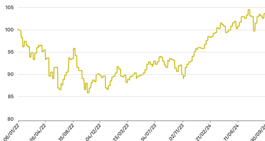
Figure 1: Performance of Davy SRI Long Term Growth Fund at 30 th September 2024

Warning: Past Performance is not a reliable guide to future performance. The value of your investment may go down as well as up. This product may be affected by changes in currency exchange rates.