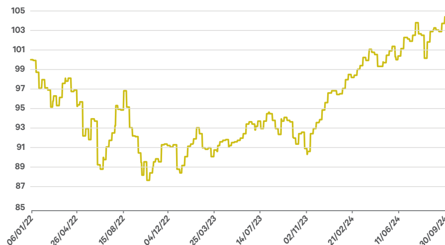
Figure 1: Performance of Davy SRI Moderate Growth Fund at 30 th September 2024