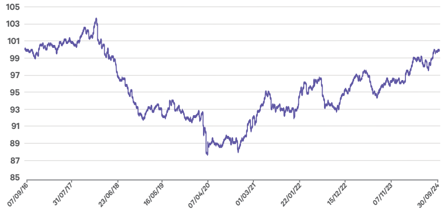
Figure 1: Performance of Target Return Foundation Fund at 30 th September 2024