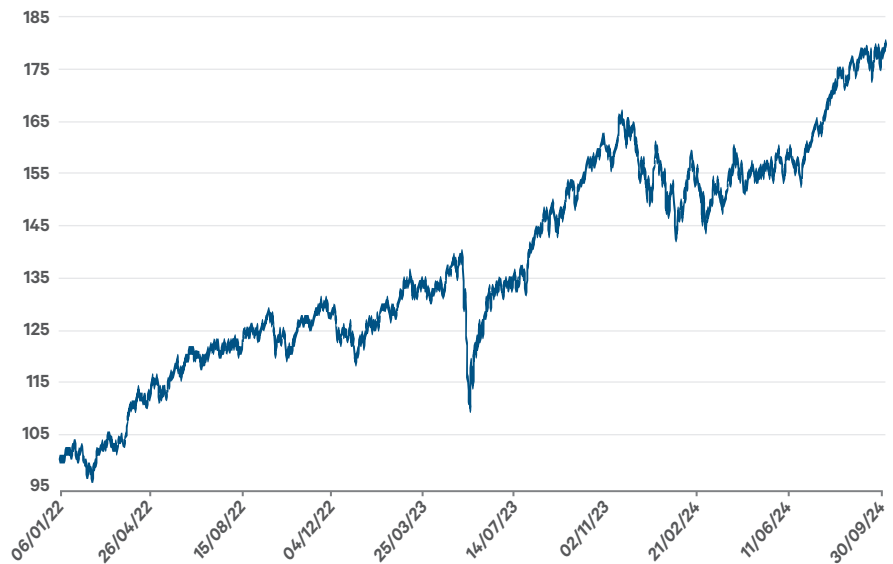
Figure 1: Performance of Davy UK GPS Long Term Growth Fund at 30 th September 2024

Warning: Past Performance is not a reliable guide to future performance. The value of your investment may go down as well as up. This product may be affected by changes in currency exchange rates.