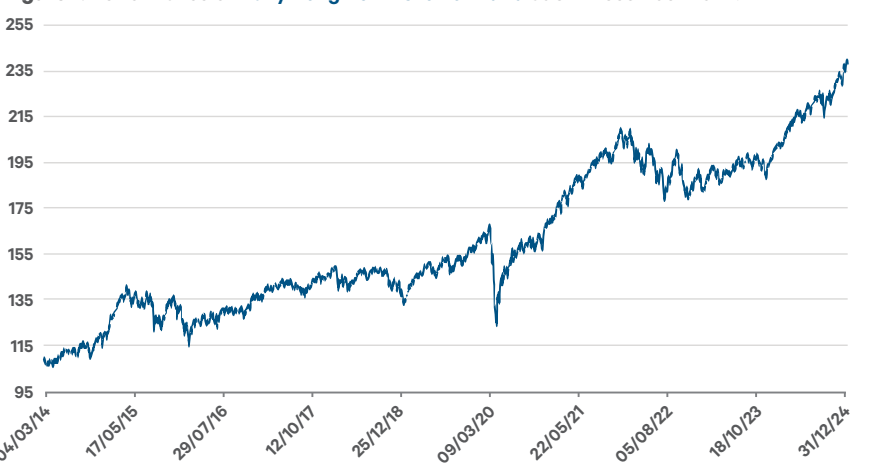
Figure 1: Performance of Davy Long Term Growth Fund at 31st December 2024.