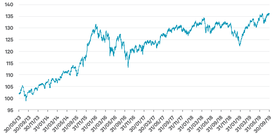
Figure 1: Performance of Davy Balanced Growth Fund at 30th September 2019 6

Warning: Past performance is not a reliable guide to future performance. The value of your investment may go down as well as up. This product may be affected by changes in currency exchange rates.