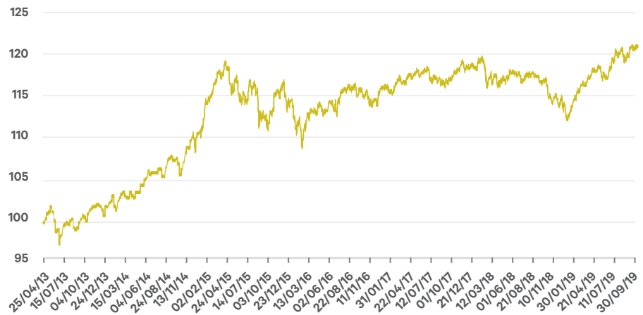
Figure 1: Performance of Davy Cautious Growth Fund at 30th September 2019 6

Warning: Past performance is not a reliable guide to future performance. The value of your investment may go down as well as up. This product may be affected by changes in currency exchange rates.